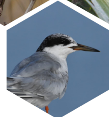
Clockwise from top: Purple Gallinule ; Barred Owl ; Painted Bunting ; Common Tern ; Bald Eagle ; Sedge Wren