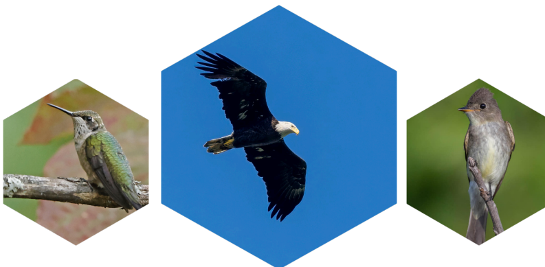
Ruby-Throated Hummingbird (Bob Crawford); Bald Eagle (Garland Kitts); Eastern Wood-Pewee (Kirk Gardner)